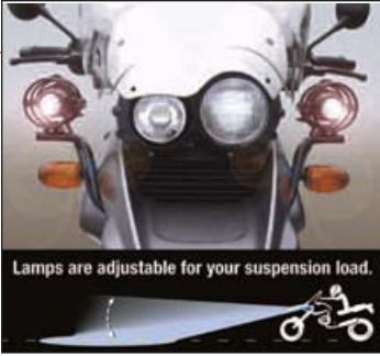
Lamps are adjustable for your suspension load.